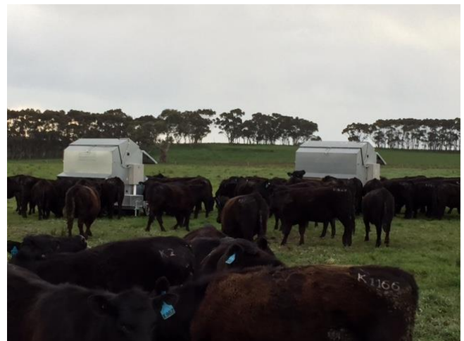
Figure 1. Two mobile feed trailers at Te Mania

At Te Mania Angus stud, Mortlake, Victoria, 122 heifers grazed a silver grass (40%), perennial ryegrass (30%), bent grass (25%) pasture with Yorkshire fog (5%) and were given access to two Sapien mobile trailers (Figure 1) that fed controlled amounts of maize supplement (1.5kg/hd/d maximum), each with four of six feed stations (2/3 per side) operating, starting on 14 September 2015.